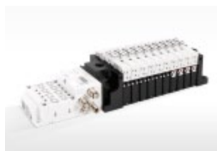
AES field bus